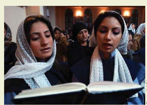
Iraqi women sing during a Christmas Mass in a Chaldean church in Baqhdad (25 December 2004).

The lack of protection of fundamental human rights, such as freedom of religion and freedom from fear and want, continues to threaten the very existence of Christians in this region.