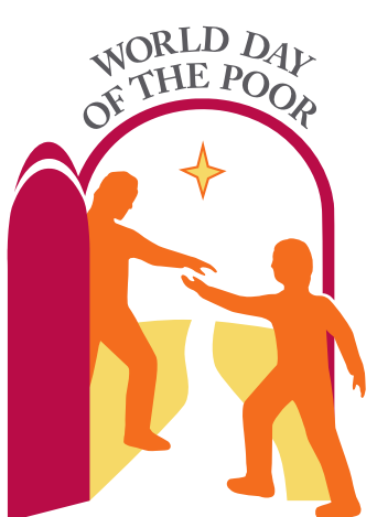
Do not turn your face away from anyone who is poor 2023

«Whenever we encounter a poor person, we cannot look away, for that would prevent us from encountering the face of the Lord Jesus»